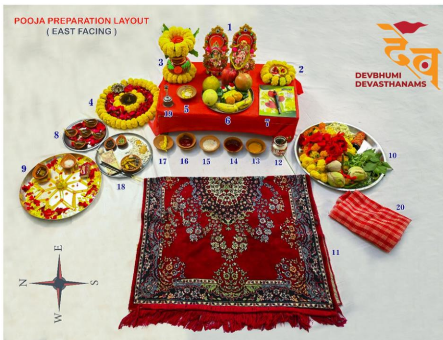
(Table with numbers in Hindi & english & puja layout )