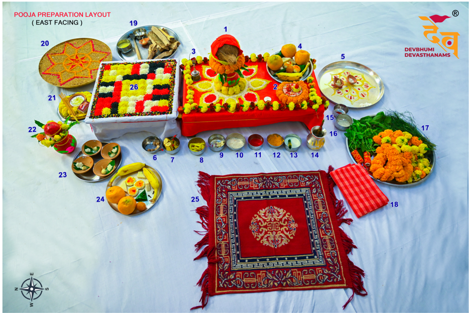
(Table with numbers in english & puja layout )